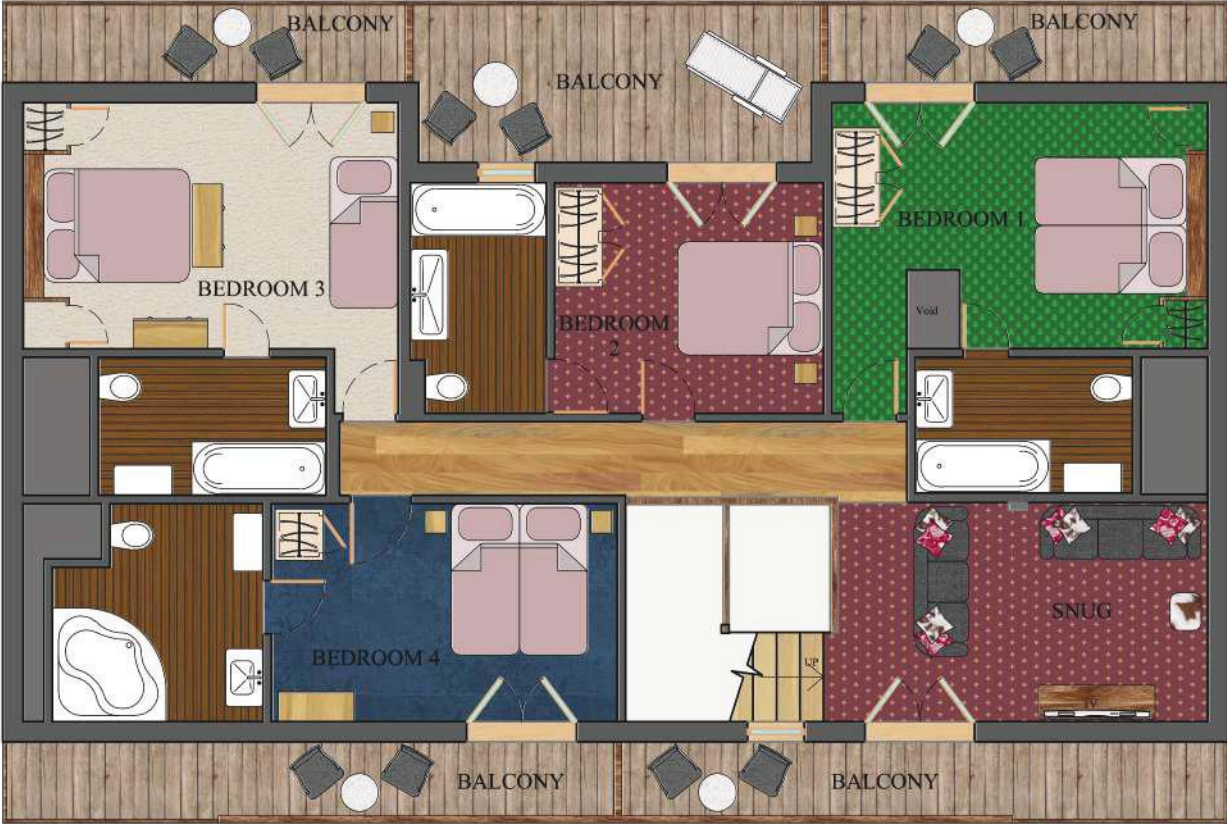
CHALET FIRST FLOOR PLAN