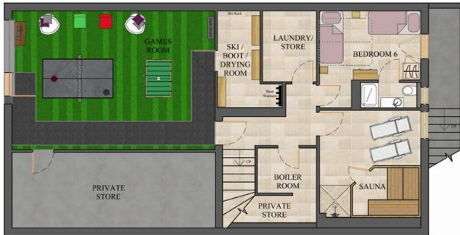
CHALET LOWER GROUND FLOOR PLAN